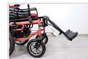
Electric Leg Lifting (MFN805ET/ETQ)