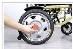
Manual/Electric Mode Switch