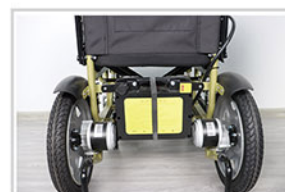
250W*2 Brush Motor