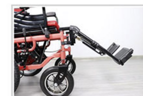
Gas Spring Leg Lifting (MFN805DT/DTQ)