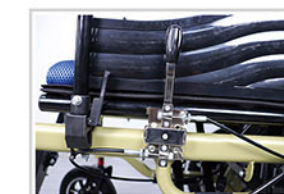
Manual Lying Back Switch (MFN805CT/CTQ&MFN805DT/DTQ)